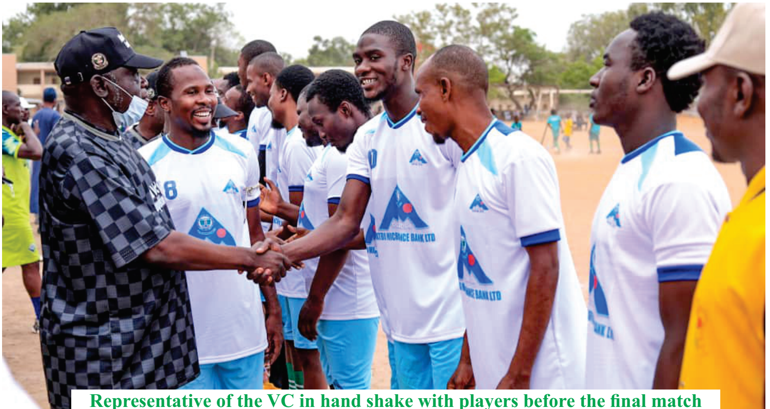
Representative of the VC in hand shake with players before the final match