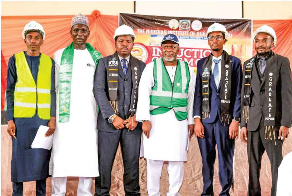
Representative of the VC and some inductees after the occasion

seek mentorship and participate in Institute programs building, pointing out that network is key to the practice.