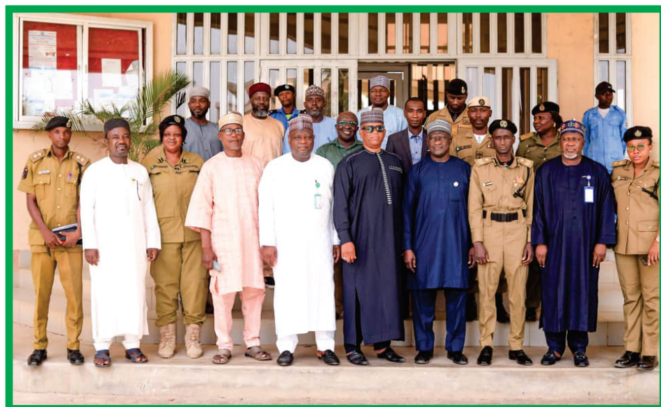
University Mgt and NDLEA Visiting team in a group Photography

He said the University has a total of 25, 780 students. He added that