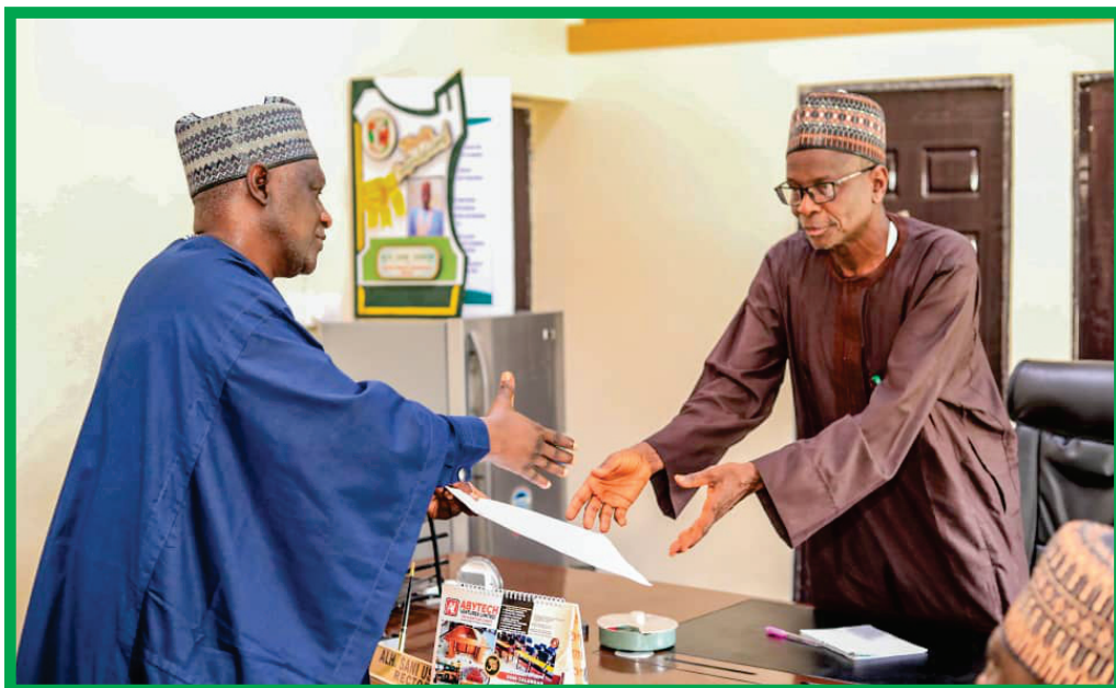
VC Presenting the condolence letter to the Rector, "FPTB"